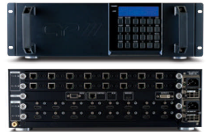
Model Shown PU-16HBT